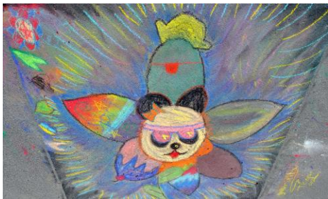
Entry #6 – 29 Palms Creative Center & Gallery (29 Palms) – Artwork: “Panda Flower Power”