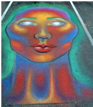
Entry #8 – Taunya Causseaux (29 Palms) – Artwork: “Rainbow Face”